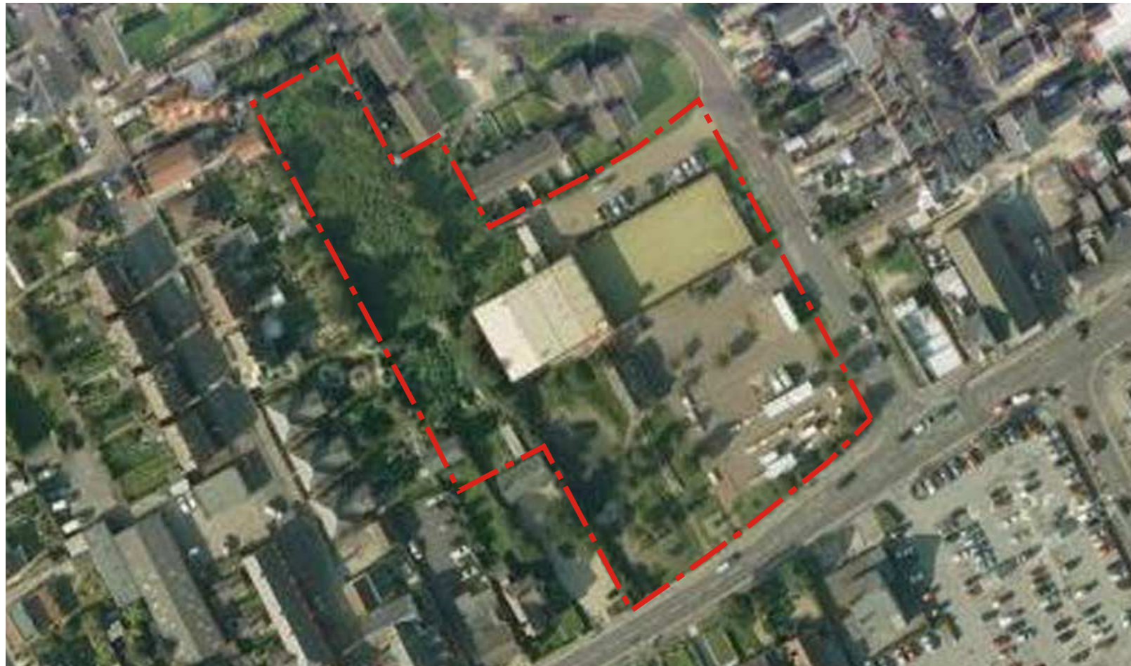
EXISTING AERIAL PHOTOGRAPH (N.T.S.)