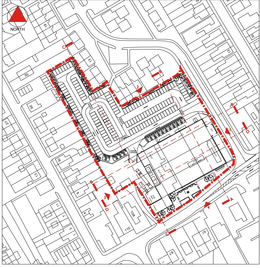
KEY PLAN SCALE 1:2000